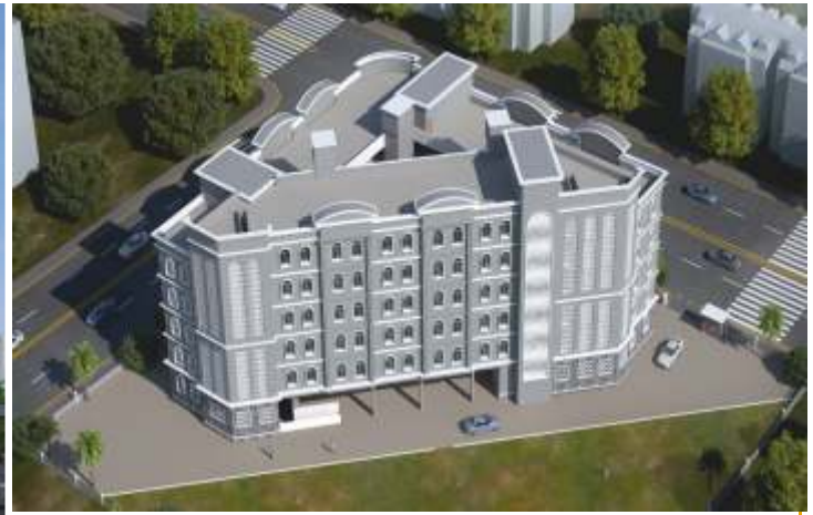
Proposed Elevation of the New School Building