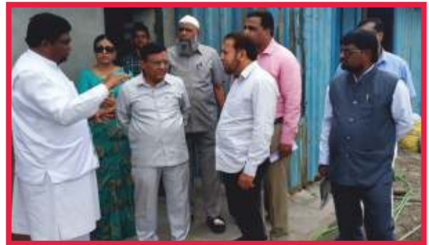
Members of West Zone Regional Panel of IDB (Jeddah) visited the New School construction site